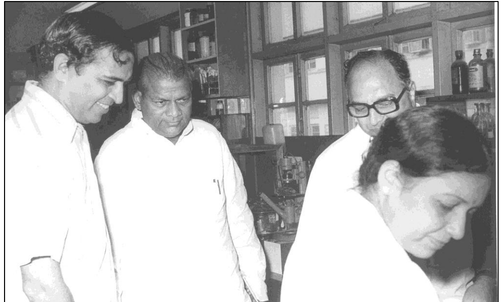
Hybridoma Laboratory at CRI