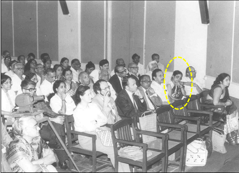
Seminar Room at CRI