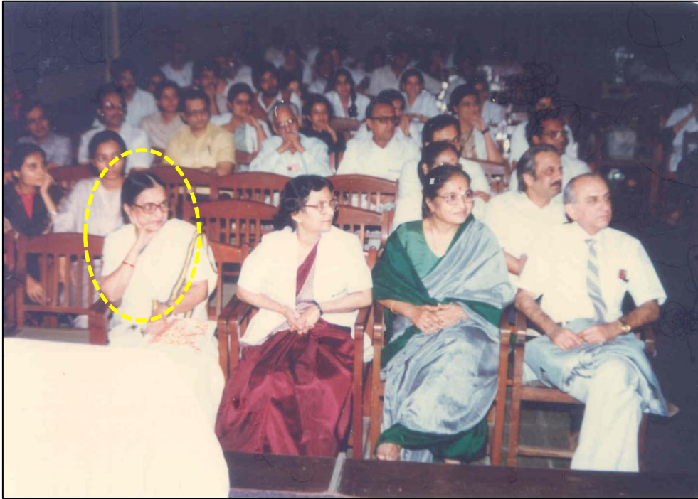
Seminar Room at CRI