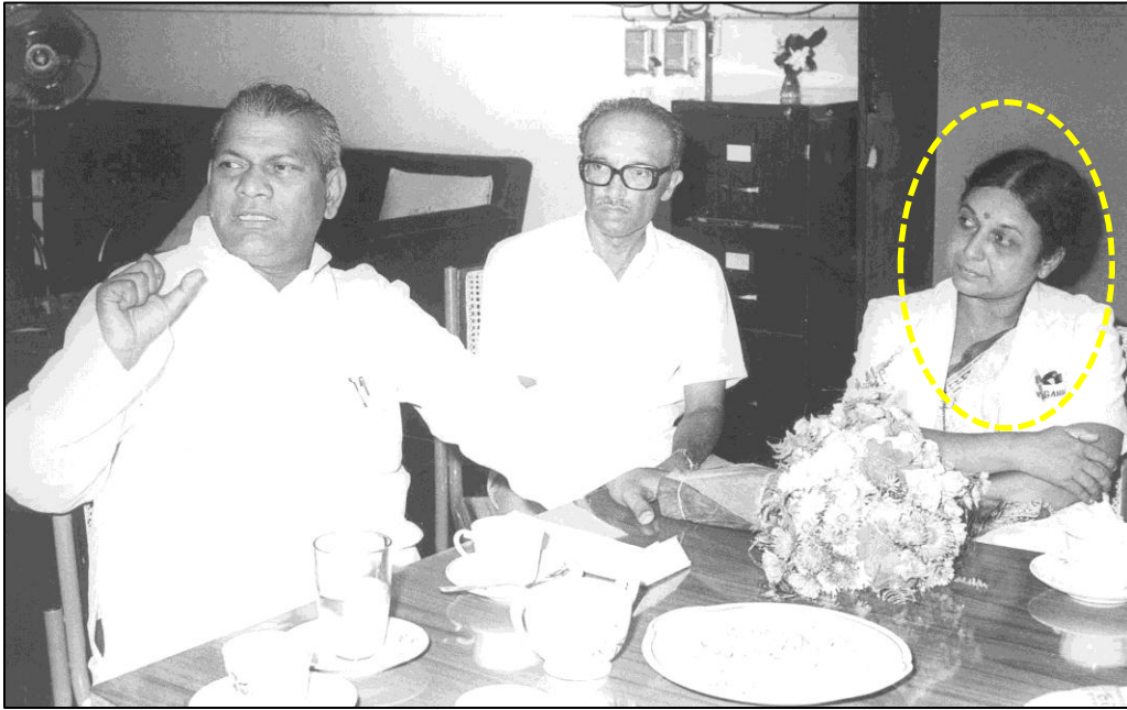
Scientific Meeting in Board Room of CRI